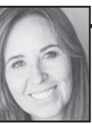
By Lacey Grogan