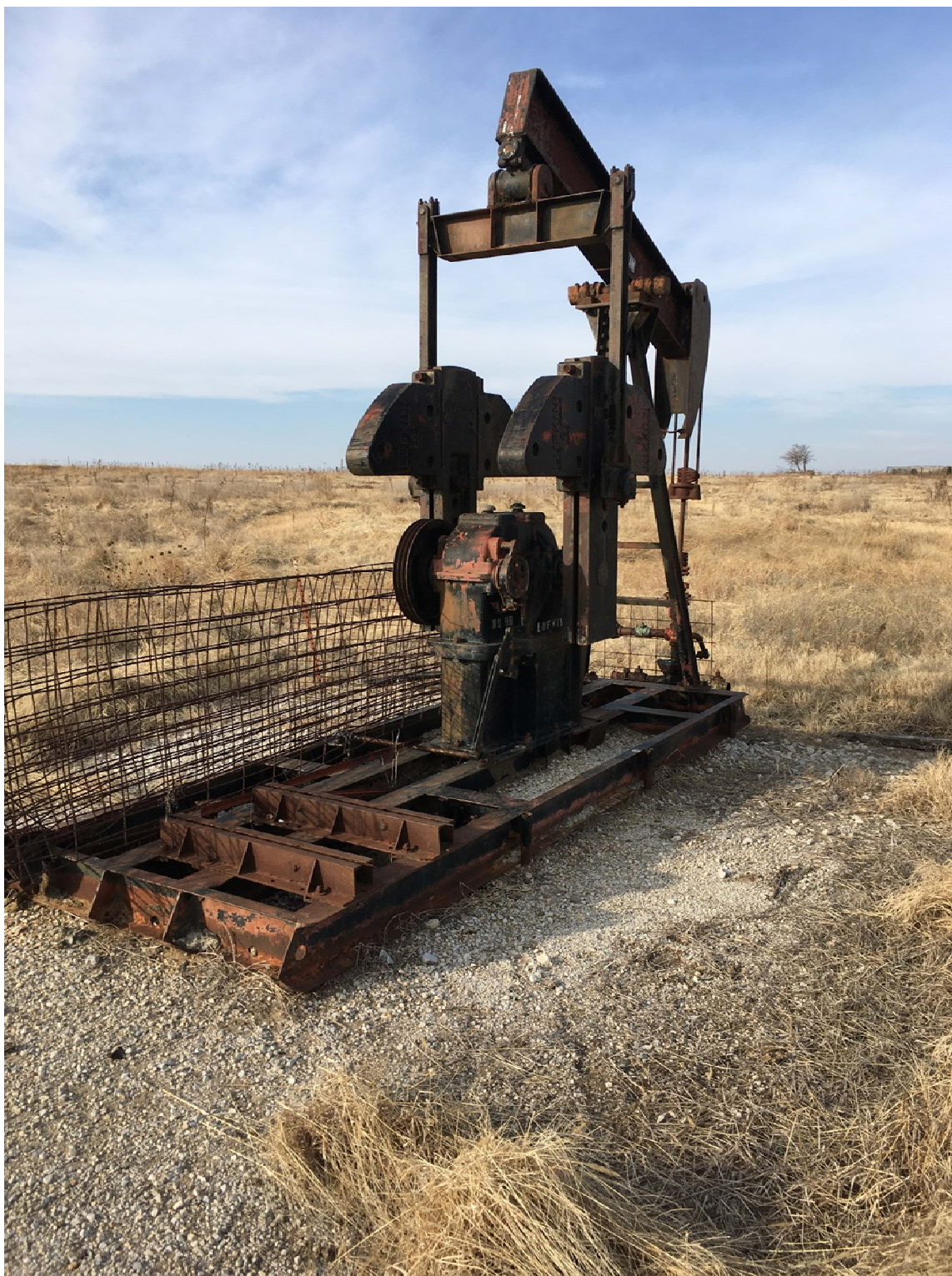
Gardiner #2, API#15-191-22187-00-00. Inactive well operated by Bear Petroleum, LLC. Located in the NE/4 of 4-33S-2E, SU. Co.