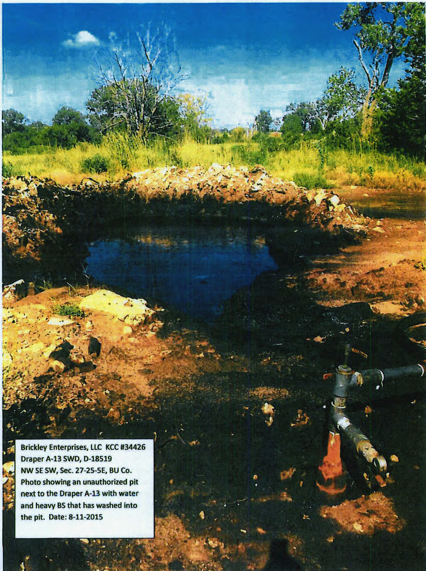
Brickley Enterprises, LLC KCC #34426 Draper A-13 SWD, D-18519 NW SE SW, Sec. 27-25-5E, BU Co. Photo showing an unauthorized pit next to the Draper A-13 with water and heavy BS that has washed into the pit. Date: 8-11-2015